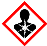
GHS08 health hazard

STOT RE 2 H373 May cause damage to the thyroid through prolonged or repeated exposure. Route of exposure: Oral.